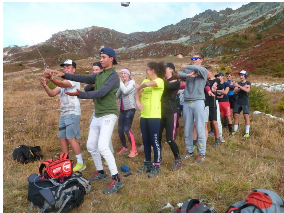
Trek and Fun