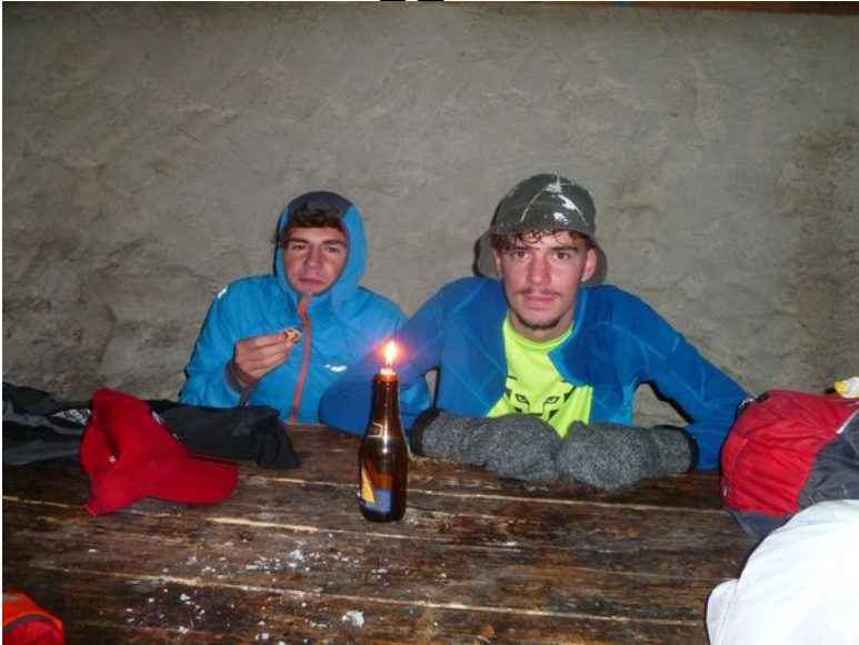
Effort and basic pleasure